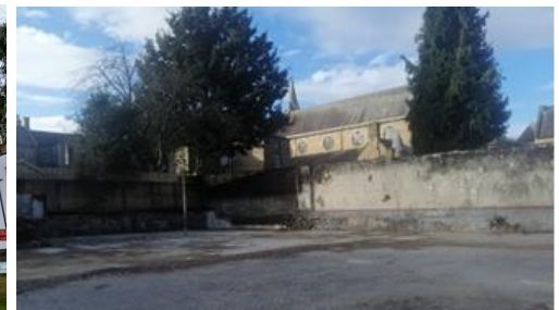
Site fully demolished post fire damage