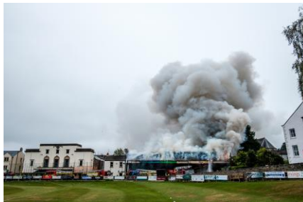
Fire on site August 2020